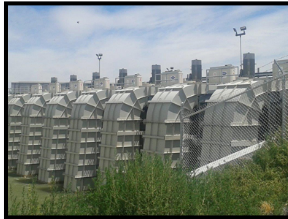
Eight Mavel TM10 Turbines Installed at North Side Canal Co.'s Head of the U Irrigation Project

Boston, MA – April 2015 – Mavel Americas, Inc. (Mavel) announced the first installation of the company's proprietary TM Modular Micro Turbine ("TM Turbine") in the Americas. Eight Mavel TM Turbines have been successfully commissioned at North Side Canal Company's ("North Side") Head of the U Project near Jerome, Idaho with production at levels 6% above expectations.