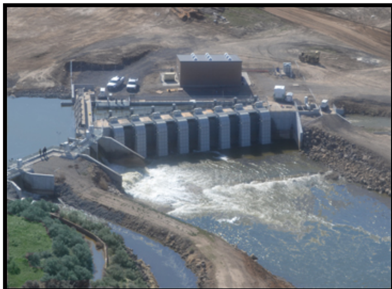
Arial view of the Head of the U Hydroelectric Power Project

Civil construction for the replacement of the diversion and drop structure began in October 2013. The equipment contract was signed in February 2014. Equipment deliveries began in October 2014 and the plant was in full operation in April 2015. While the entire project was estimated to provide 4.2 million kW of energy per year, Hansten notes that the plant is operating with installed capacity of 1.28 MW and “produces 6% more energy than what we originally planned.”