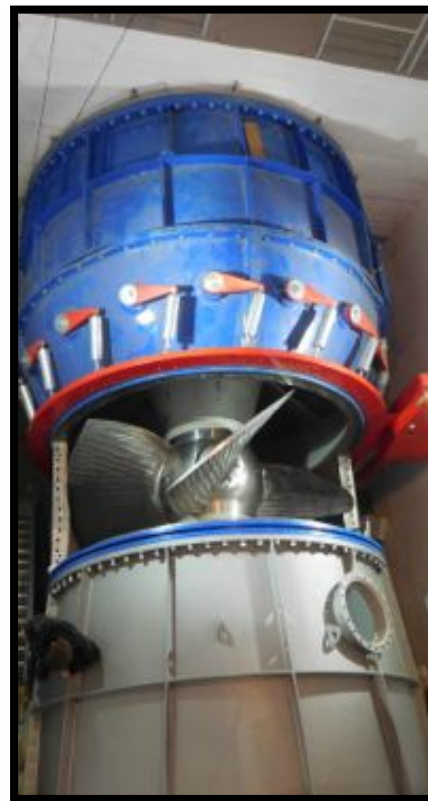
Installation of Unit 1 at the Štvanice HPP