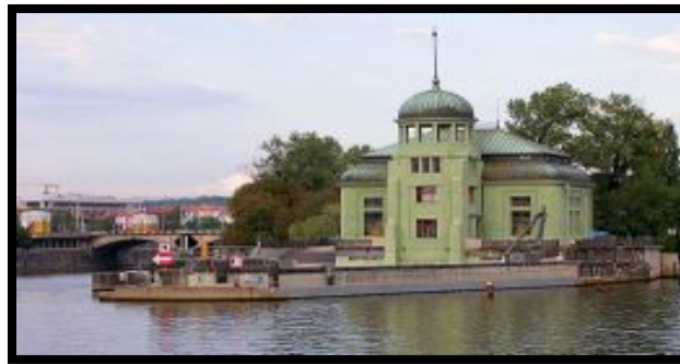
Prague's Štvanice Hydroelectric Power Plant

Benešov, Czech Republic – 8 August 2018 – M a v e l, a.s. (“Mavel”) announced the successful installation, testing and commissioning of the first of three generating units at the Štvanice Hydroelectric Power Plant (Štvanice HPP) on the Vltava River in central Prague, Czech Republic. The output of the new double regulated Kaplan "S" turbine Mavel Model KS3400K4 exceeded guaranteed values by more than 25%.